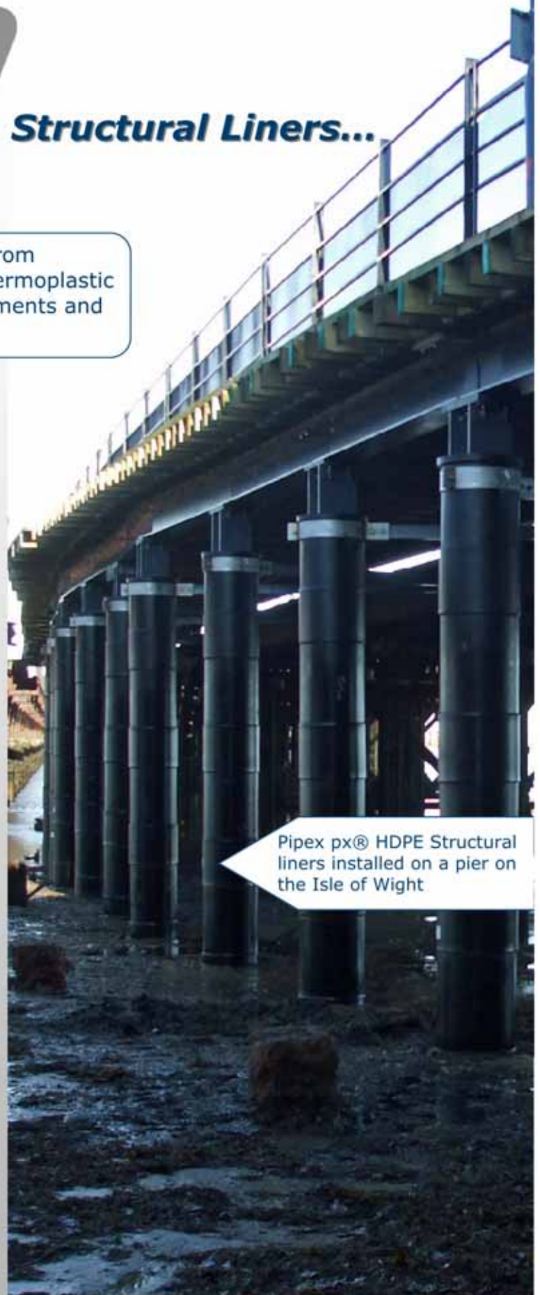
Pipex px ® HDPE Structural liners installed on a pier on the Isle of Wight