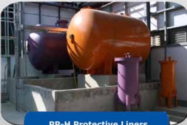
PP-H Protective Liners