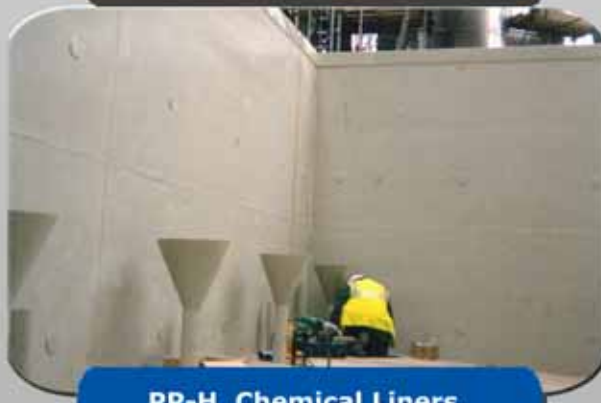
PP-H Chemical Liners