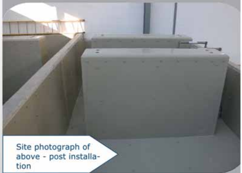
Site photograph of above - post installation