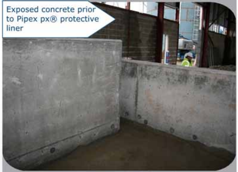
Exposed concrete prior to Pipex px® protective liner