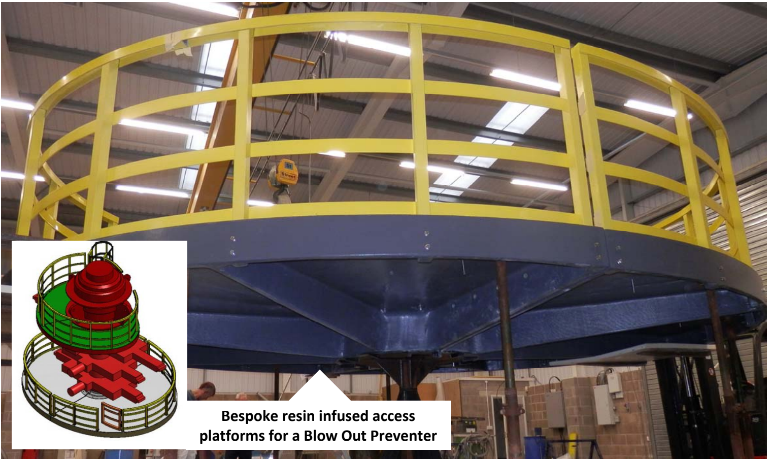
Bespoke resin infused access platforms for a Blow Out Preventer

The combination of our high quality materials and unique manufacturing capabilities attains a product of superior strength, durability and longevity, whilst also providing significant weight savings, typically 1/3rd compared to traditional materials.