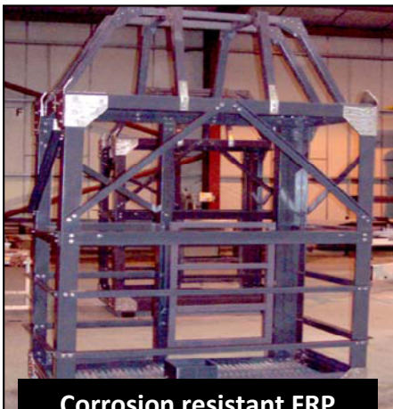
Corrosion resistant FRP transport basket, Offshore